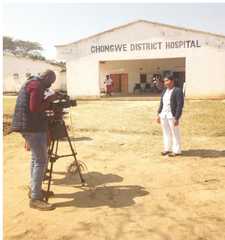
Filming in Chongwe

The Association has had to readjust its budget to accommodate the increase in television airtime as it can be costly. The interview and editing process is set to be completed by August as the documentary is intended to be showcased on the 29 th of August given that it is Zambia's National Epilepsy Day.